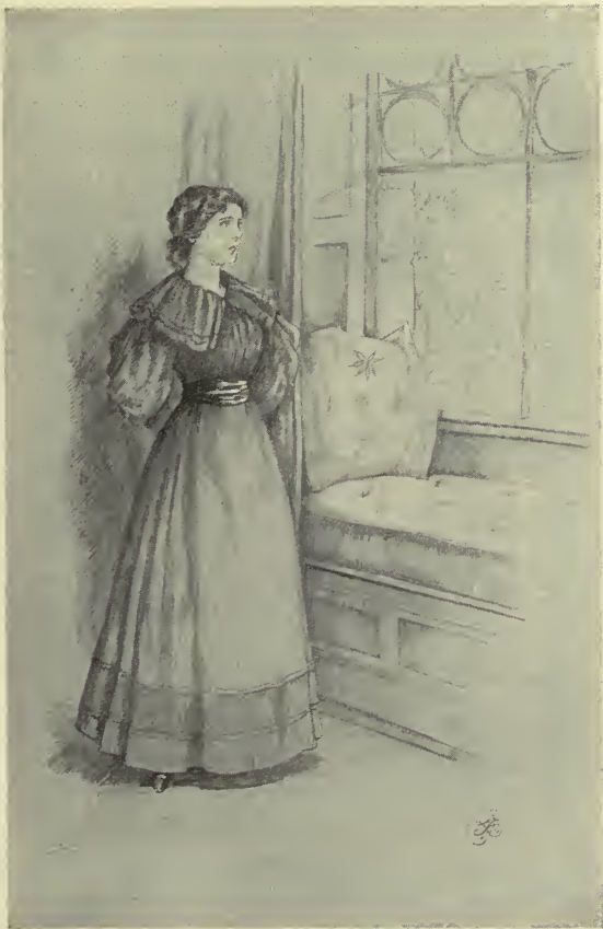
“POLLY . . . STOOD AT THE FARTHER LIBRARY WINDOW”